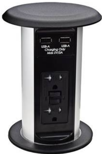
Pop-up Kitchen Power

https://www.mockett.com/power-communication-systems/kitchen-power/pcs77a-usb.html